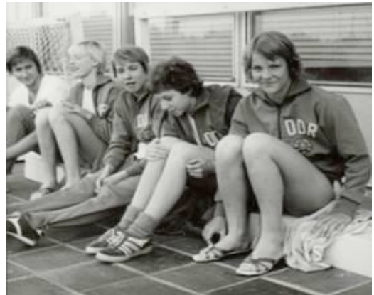
Doping for Gold , 2007

The films she has executive produced include: the award-winning documentary War Feels Like War (2004), shown on POV and around the world; The Headmaster and the Headscarves (2005), an acclaimed BBC documentary following young Muslim girls in France; and Massacre in Luxor (2002), which recounts the 1997 devastating terrorist attack in Egypt. Her most recent film Doping for Gold , which recounts the devastating effects of East Germany's secret doping program on its women athletes, will air on PBS this Spring.